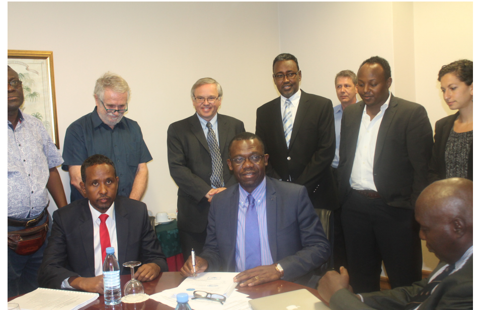
SomaliREN signs MoU to join UbuntuNet and AfricaConnect program, Maputo, Nov 2015