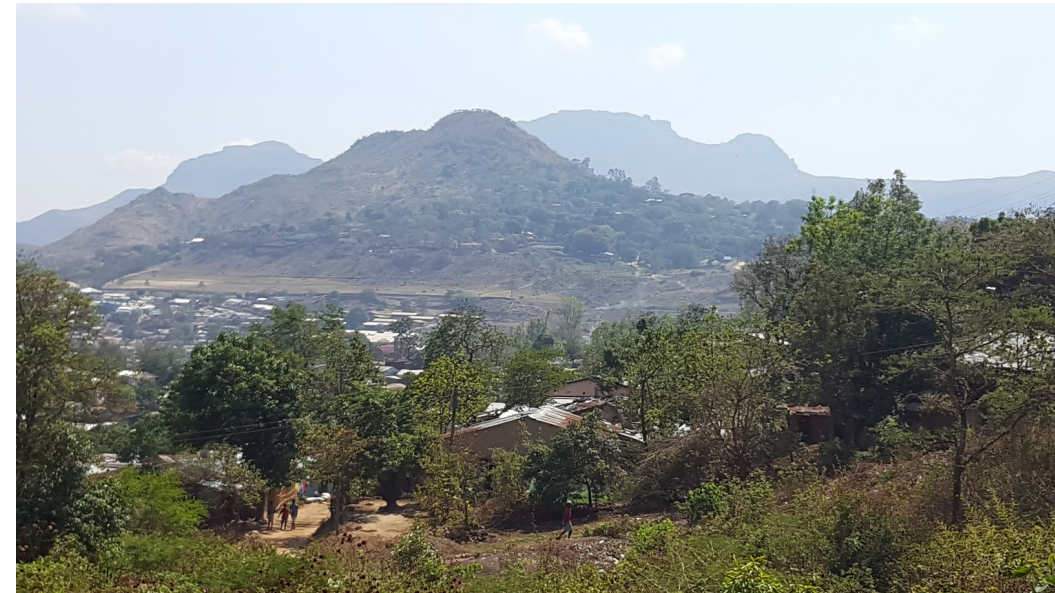
View over Blantyre, where MAREN POP and IXP are located