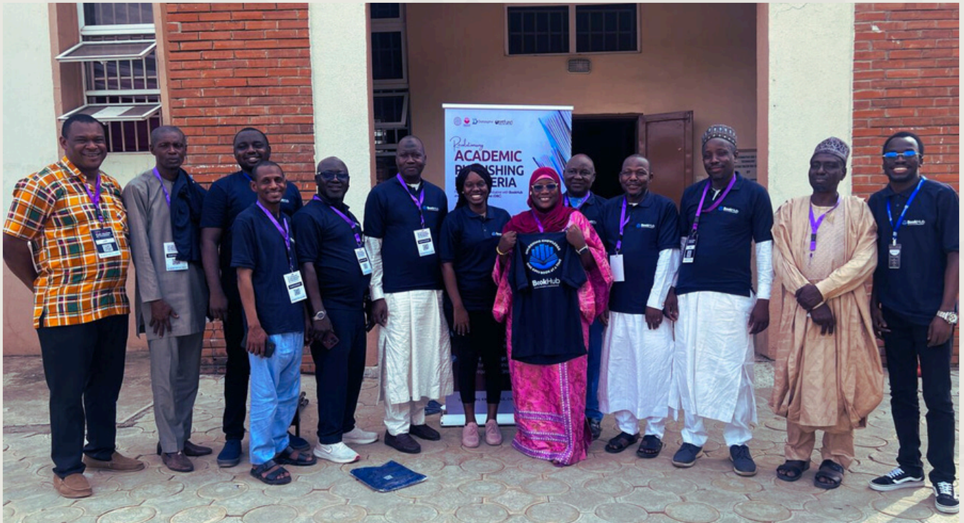
APC Directors and Staff from FUTMINNA Academic Publishing Centre and Datasphir